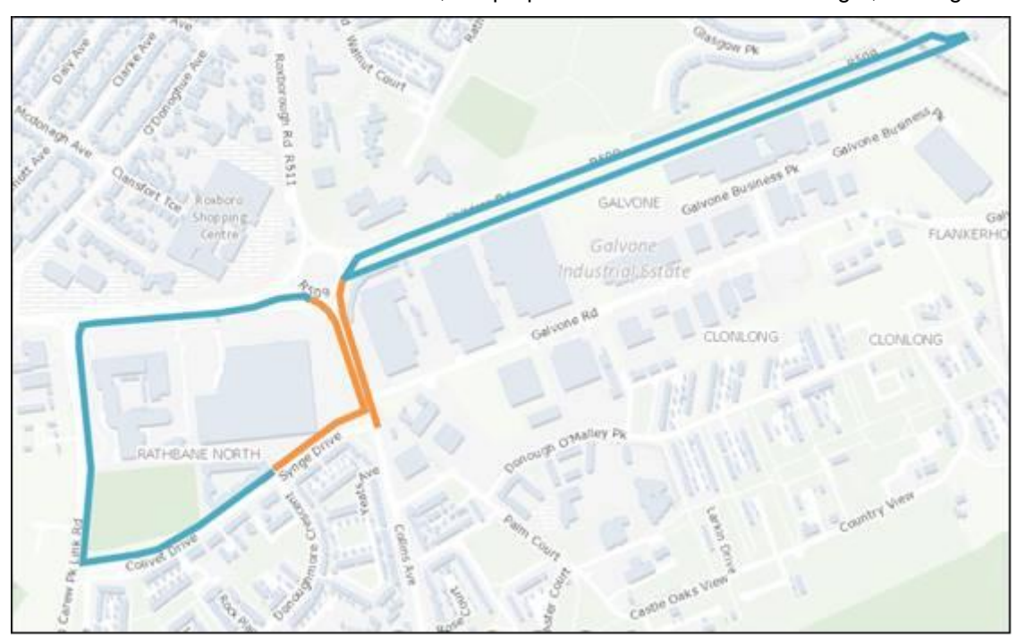
Figure 2.1: Site Location showing planning requirements - Part 8 for the section of the project requiring private ownership lands (orange) and Section 38 elsewhere (blue)

The proposed active travel scheme will be situated along existing roads and existing green areas along Childers Road, John Carew Park Link Road, the R511, and Roxboro Roundabout. The scheme will also run through parts of Limerick Enterprise Development Park and along the northern side of Galvone Industrial Estate. In total, the proposed link will be 650m in length, see Figure 2.1.