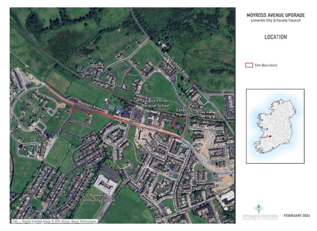
FIGURE 1-1 SITE LOCATION AND RED LINE BOUNDARY

This Screening Report for Appropriate Assessment forms Stage 1 of the Habitats Directive Assessment process and is being undertaken in order to comply with the requirements of the Habitats Directive Article 6(3). The function of this Screening Report is to determine if it can or cannot be excluded, on the basis of objective information, that the project, individually or in combination with other plans or projects, will have a significant effect on a European Site. This Screening Report has been prepared to provide information to the competent authority to assist them in their determination as to whether a Stage 2 Appropriate Assessment is required for the project.