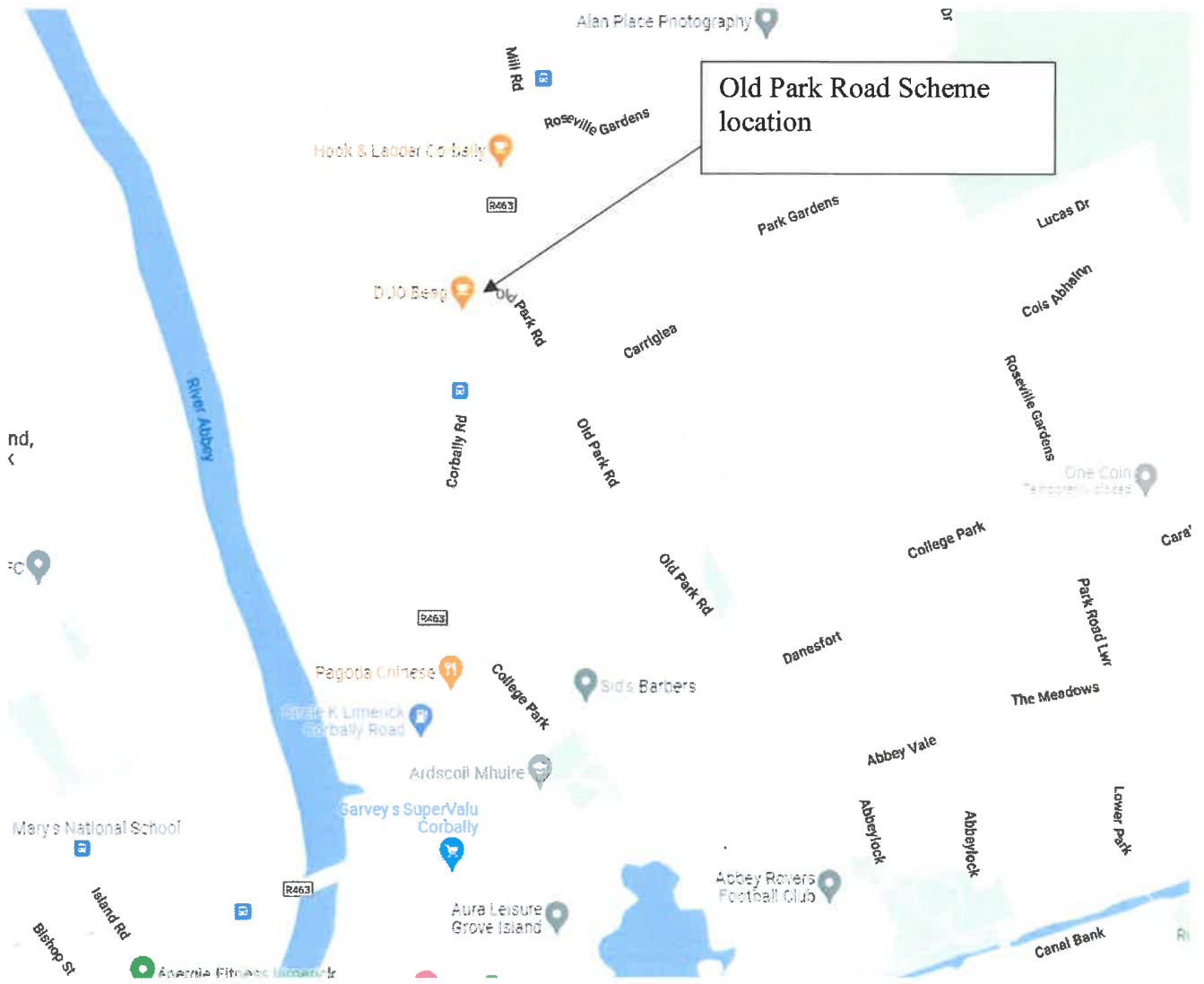
Figure 2.1: Site Location