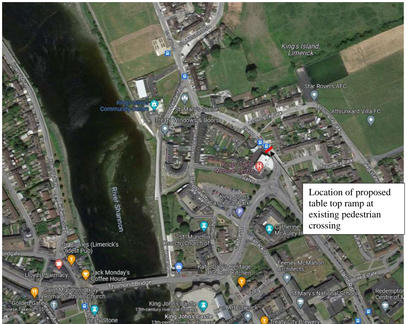
Figure 2.1: Site Location