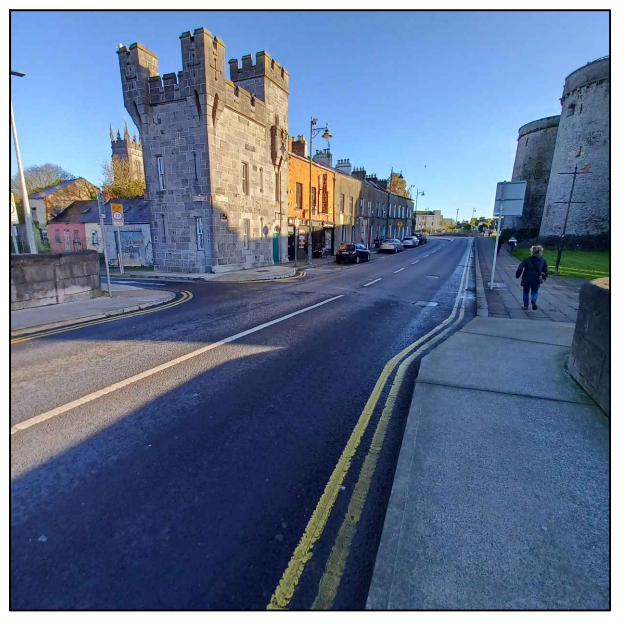
VIEW OF PROPOSED CROSSING LOCATION

SITE PLAN + PROPOSED WORKS SCALE: 1:25@A3