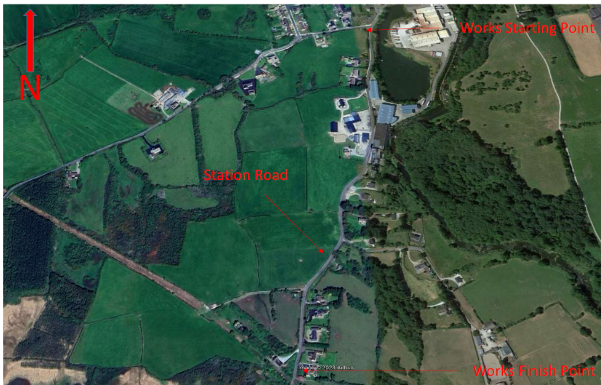
Figure 1.1 Station Road, Askeaton